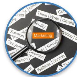
Marketing & Media