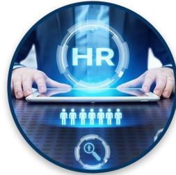
HR & Administration