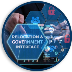
Relocation & Government Interface