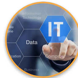
IT & System Implementation